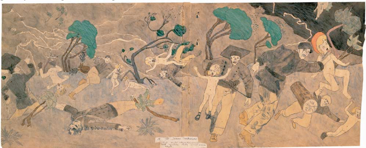
Figure 1 18 at Norma Catherine. But Wild thunderstorm with Cyclone like wind saves them

I only discovered Henry Darger this summer through a painting teacher I had. I've been interested in little girls doing devious things, and I fell in love when I saw his work as well as his story. The fact that they found his collection of illustrations after his death seems so right. He didn't publish his works during his life but made books of disturbing illustrations for himself, because he needed to. That's beautiful to me. His style is so careful and strange. It consists of many young girls, mostly transgender people (many are nude), in fright or concern (or sometimes just apathetic) usually showing they are in danger or are being harmed by older men or other things. The colors aren't the usual creepy tones (grey, purple, black) but actually washy, colorful pieces. This makes it even more disturbing somehow. Illustration No.1 is one of the few gloomy colored pieces in Darger's collection.