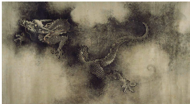
Chen Rong's Nine Dragons, representing each animal part that makes up the dragon