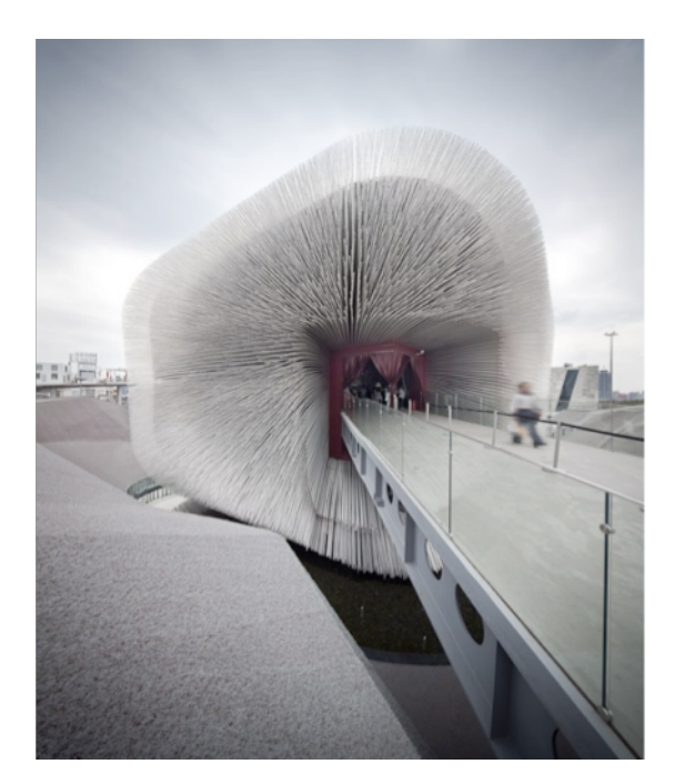
Jee Young Lee

In addition to my research on specific artists, I have also been looking into how certain materials affect the build of a structure. When I first started researching, I decided to focus on bamboo structures because I liked the flexible and curvy shapes created out of bamboo. A lot of the three dimensional shapes that I have created so far mimic certain curves and arches of shapes that can be made out of bamboo. For one of my structures