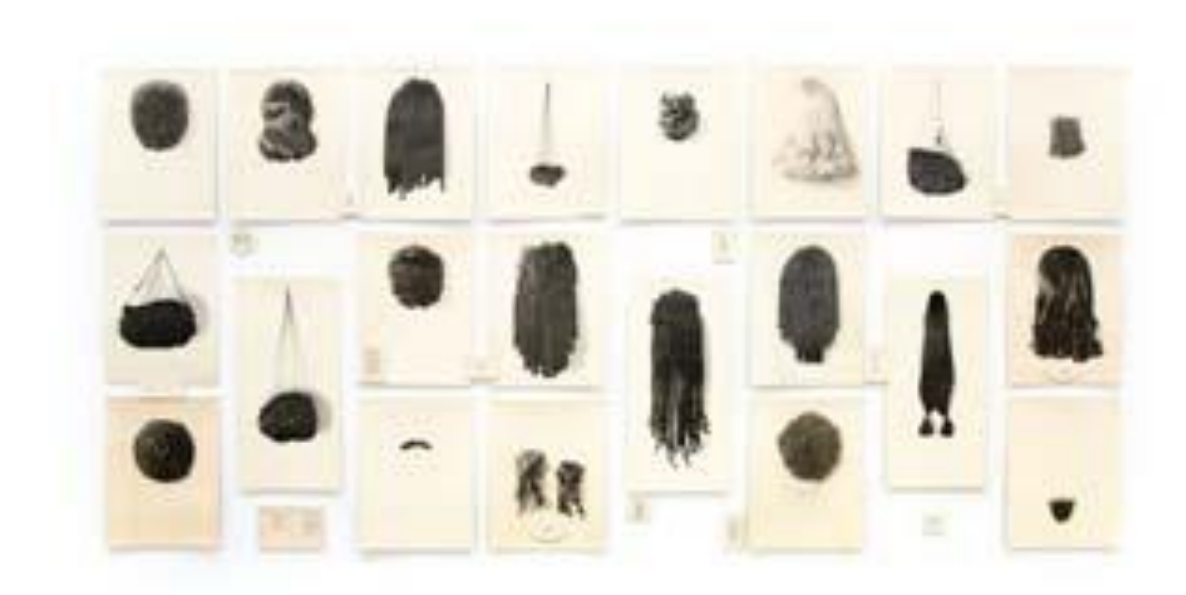
Figure 5 Wigs- Lorna Simpson