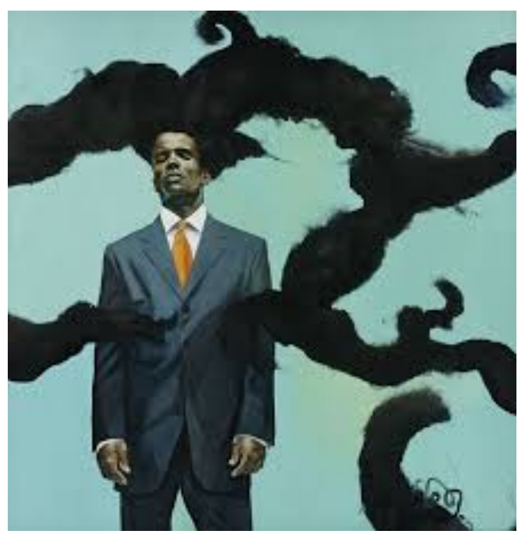
Figure 1 Conspicuous Fraud Series #1- Kehinde Wiley

because I wouldn't be able to see my hair turn into something that once deemed "beautiful" society something I, myself see "beautiful". The natural hair movement shaped me into a woman with a sense of cultural pride and confidence.