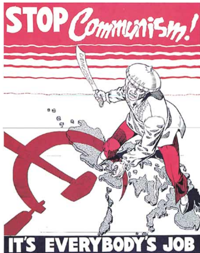
Figure 2 American Propaganda poster from the Cold War

You get to decide which of these factions to back, or to reject them all as they fight to gain complete control over the Mojave. However, no faction is inherently good, in fact, that's what the game is trying to get you to realize.