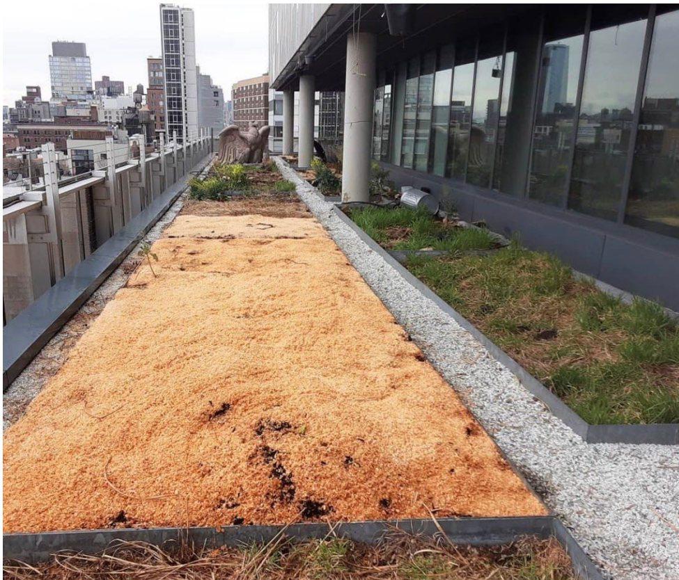
Cooper's garden beds, dormant for now

As spring begins this year the garden lies dormant due to the Covid-19 pandemic, but it is the hope of Jasper and other garden volunteers that it will be revived when campus opens and that students will be able to get needed compensation for their time working there.