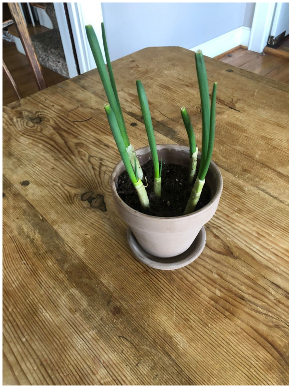
My onion plants, nine days after starting

Not all of us have the space for an outdoor garden, but many herbs, fruits, and vegetables can be started in pots indoors from scraps usually discarded. A dish of water and a space with adequate sunlight is all that's needed to begin regrowing scraps from vegetables like green onion and celery.