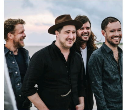
Mumford & Sons