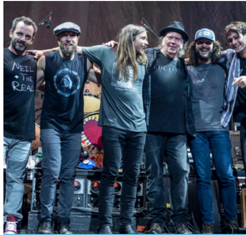
Neil Young + Promise of the Real